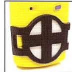
Auxiliary Filter Kit